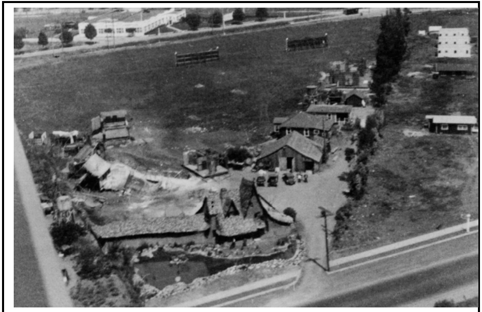
Above: Willat Studio Culver City 1920