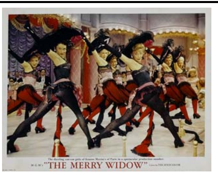
Below: A wonderful poster from the film.