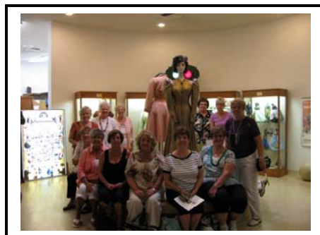
Below: CC Sister City Student Exchange group who visited in August.