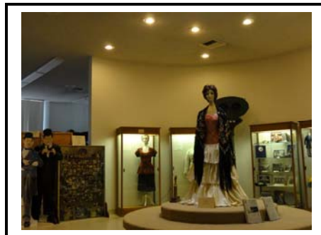
Above: The Fiesta costume display for the 60 th Anniversary of the annual event.