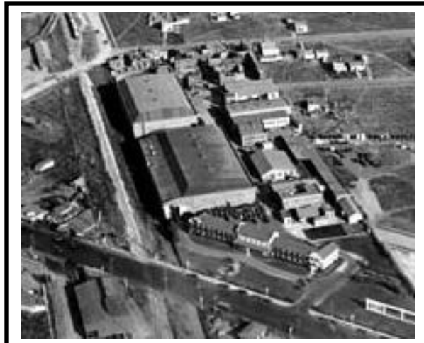
(Left) Aerial photo of the Hal Roach Studios, c. 1930s.

To find new studio space for expansion, Hal Roach called his friend Harry Culver and purchased his initial 10 acres at $1,000 an acre. From 1919 to 1963, his "Laugh Factory to the World" was a proud fixture in town at 8822 Washington Blvd., near the railroad tracks at National Blvd.