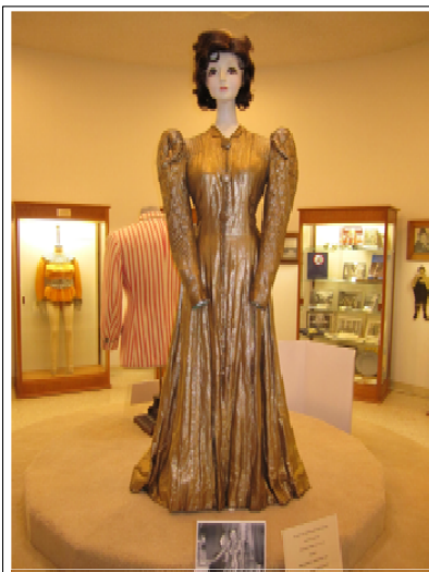
Above: Full "golden" costume from Broadway Serenade .

Sorry, photo referenced above will be available next issue.