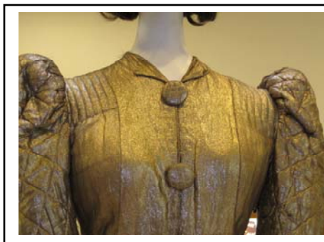
Below: Detail of sleeve with designer Adrian's famous signature large puffed sleeves