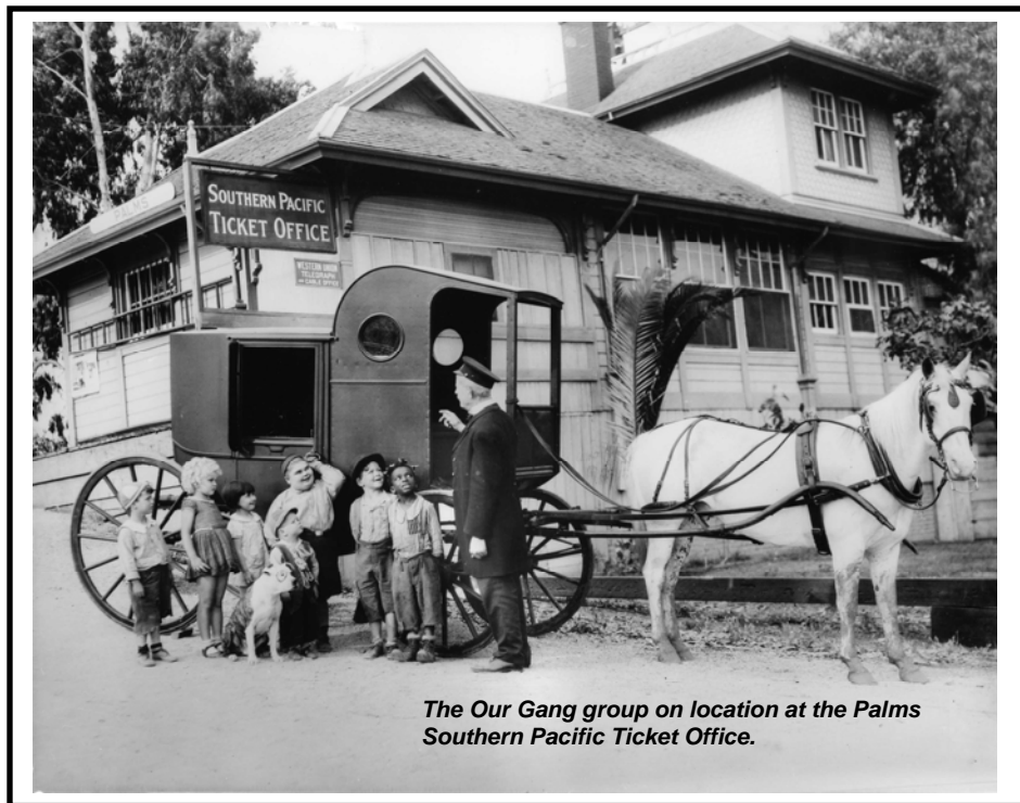
The Our Gang group on location at the Palms Southern Pacific Ticket Office.