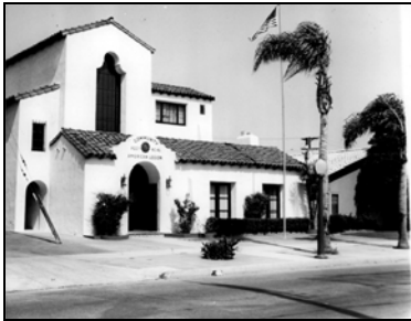
CCHS Historic Site #5

The Jewish Home for the Aging will be proposing a new project that will surround the historic American Legion Building, the Society's Historic Site #5, and a structure the city has recognized as a historic resource. Their preliminary plans show the structure intact, as a part of the project. They have engaged a historic consultant.