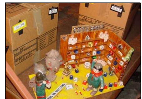
Unpacking the "Babes in Toyland" Grogg woodcarvings.