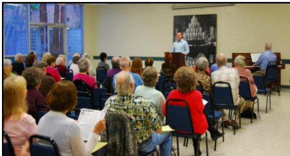
Below: A full audience enjoying participating in the sing-along with our musical guests and song sheets.