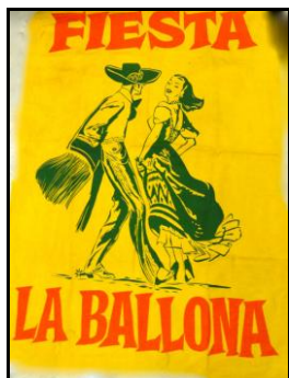
Left: Does this vintage banner remind you of early Fiesta La Ballona? Visit the Archives during the Fiesta La Ballona to take a look back into Fiesta history!

CCHS ARCHIVES & RESOURCE CENTER (ARC) Veterans Memorial Building • 4117 Overland Ave., Culver City, CA Open 1 st and 3 rd Saturdays, 1-3 pm, and by appointment Free admission. (Enter from parking lot behind the VMB.) Mail: PO Box 3428, Culver City, CA 90231-3428 Tel: 310.253.6941 • Email: info@culvercityhistoricalsociety.org Web: www.culvercityhistoricalsociety.org