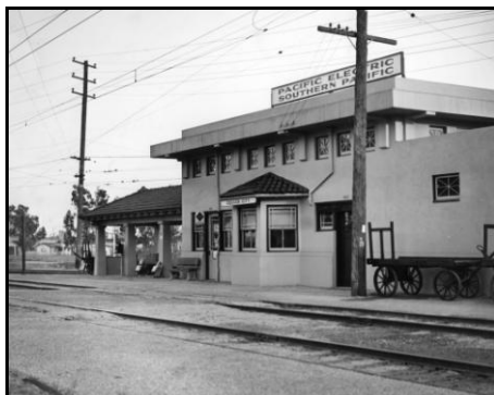
Above: A photo from the MGM Research Library of the old Pacific Electric Southern Pacific "Ivy Substation" on Venice Blvd.