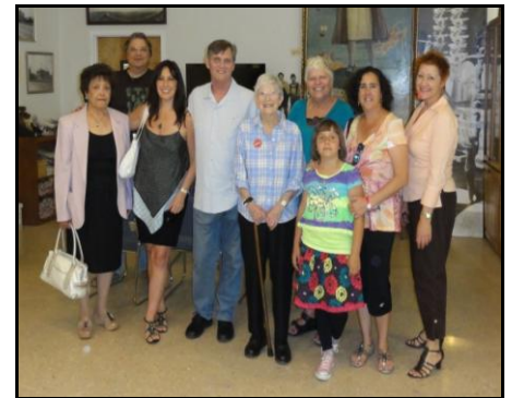
Above: Visitors on a recent Saturday at the CC Historical Society Archives and Resource Center.....from Washington state to local Culverites.....