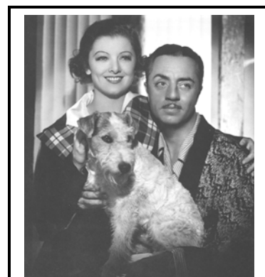
Myrna Loy, William Powell & "Asta."

PS: Can't forget The Thin Man , Nora and, of course, "Asta."