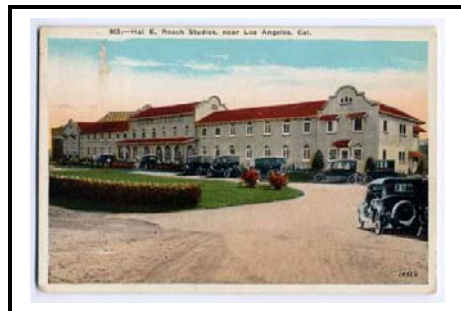
Hal Roach Studios, c.1920s.

I watched Mickey and Judy grow up; Our Gang remaining kids forever; Tom and Jerry wreaking havoc. I experienced the burning of Atlanta and Gone with the Wind , the San Francisco earthquake, locusts and The Good Earth , and Singin' in the Rain . I watched chariots race in Ben Hur , sport cars in Grand Prix , and Buster Keaton on a locomotive. I knew The Wizard of Oz , Gunga Din , The Great Ziegfeld and The Greatest Show on Earth .