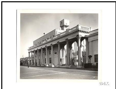
MGM's Colonnade entrance on Washington Blvd. built in 1915.

I first saw mine and walked on my "dream street" in 1930: Washington Boulevard in Culver City, California. Contained within a mile on that fabulous thoroughfare is the aorta of this capital of entertainment. My footprints shared the path with the entertainment greats – factual, historical and fictional – who worked at the studios of the reel cinema world which were created and built along its curbs, such as Triangle, MGM, RKO, Pathé and Desilu.