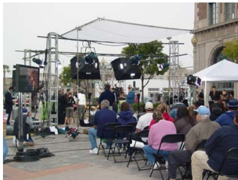
KTLA Morning News was broadcast live on May 18, 2007, from 7-10 am. in Town Plaza. (In the distance, our City Council is being seated for interviews.)

Living History is over for this year, and it was tough saying goodbye to the seniors who have participated for the past three