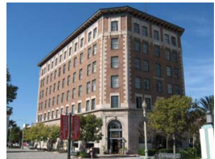
The historic Culver Hotel, built in 1924.