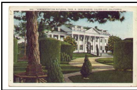
Thomas Ince Studios – later RKO, Selznick Studios, Desilu among other names.

From Thomas Ince, C.B. DeMille, Louis B. Mayer, Hal Roach and David O. Selznick came forth a mecca of creativity which encouraged the talents of Thalberg, Freed, Stromberg, Welles, Ford, Stevens, Capra and Fleming, as well as Minnelli, Pasternack, Koch, Franklin, Lubitsch, Wyler, Wilder, Dassin, Zinnemann, Adler, Leonard, Frankenheimer and Spielberg, among so many others. These were the manufacturers of dreams – entertainment, comedy, drama, romance, music, dance -- all creating this miracle mile in the real Hollywood: Culver City, USA.