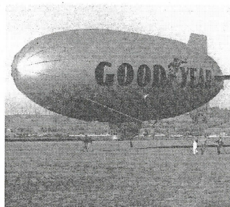
Goodyear blimp at CC airport