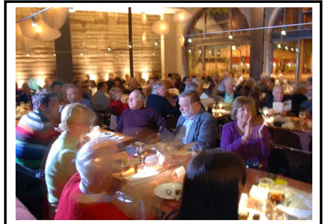
A very good time was had by all! More than 80 CCHS members and guests celebrated the Installation of the new CCHS Board.