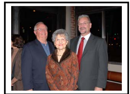
(at right) The "Newton Clan"