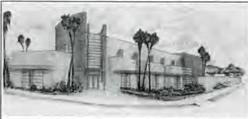
Rendering of New CC Senior Center.

Among those on hand to open the long-awaited new site were Los Angeles County