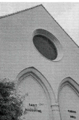
von Stroheim's stained glass