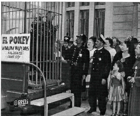
El Pokey, 1954

In 1974, Culver City's Fiesta entered a new era.