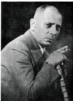
Eric von Stroheim

Hardly a role model for altar boys in real life, von Stroheim was long gone from MGM by 1936 when the second Church (now the Parish Hall) was built which makes his gifts to the Church even more interesting. Anyone who has a clue as to what prompted von Stroheim's generosity can contact me at (310) 204-6920 or email: rjhculvercity@aol.com .