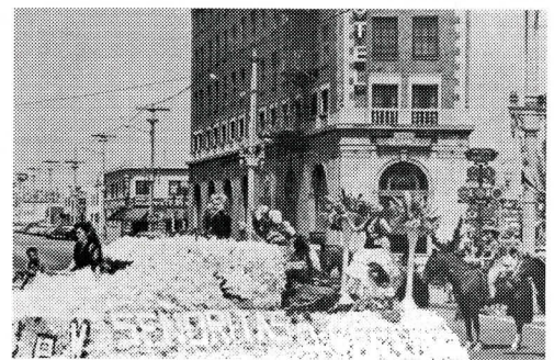
early Fiesta parade, c. 1950s