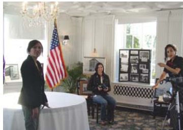
Culver City's IT crew set up in Harry Culver's second floor office to interview locals with a history. The room was filled with vintage photos and displays.

The screening of Laurel & Hardy's 1928 Putting Pants on Philip which was shot at and around the Culver Hotel was a treat sponsored by the hotel.