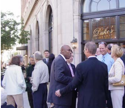
Outside the Culver Hotel, city staff and elected officials mingled with locals to the music of a big band.