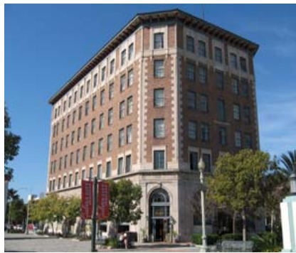
The Culver Hotel – Then & Now