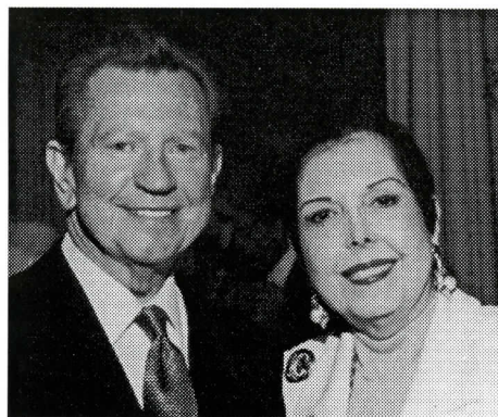
Donald O'Connor and Ann Miller