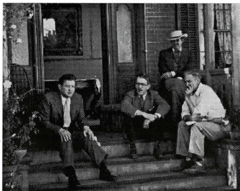
"GWTW" (L-R): David O. Selznick, Sidney Howard, Clark Gable, Victor Fleming