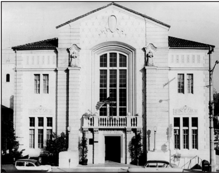
City Hall, pictured in the 1950s. (Historic Site No.1)