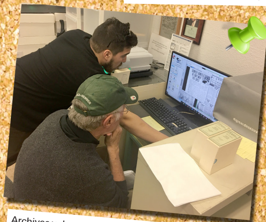
Archives volunteers digitizing microfilm. (Art Litman)