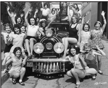
1929 promotion of Paramount's sound films. World's first fleet of Sound Trains.