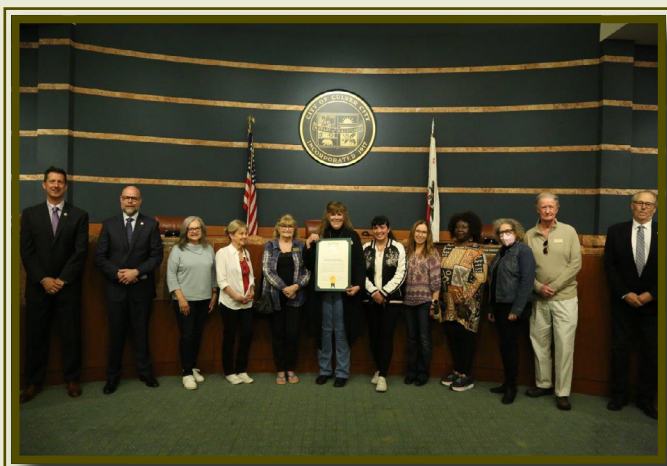
CCHS receives Proclamation at the May Historic Preservation Month.