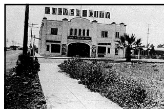
1917, Culver City's first city office

site of what is now the landmark Culver Hotel. The rate was $15 per month, which was published in the Culver City Call newspaper. The theatre photo appears in Charles A. Midgely's scrapbook, found in Washington State. It tells of his family's trip to California circa 1920. The page begins, "This is Thos. Ince's little theatre where the actors go to see themselves in their new production. It is located near the studio and has a seating capacity of nearly 300.