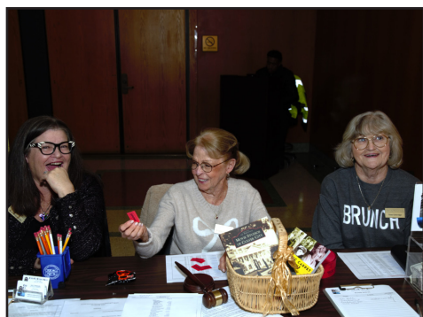
Front Desk - Installation 2025