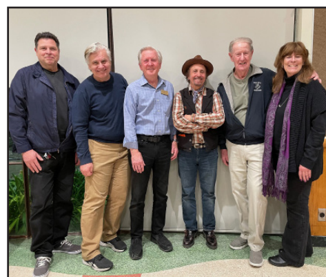
The gangs all here!