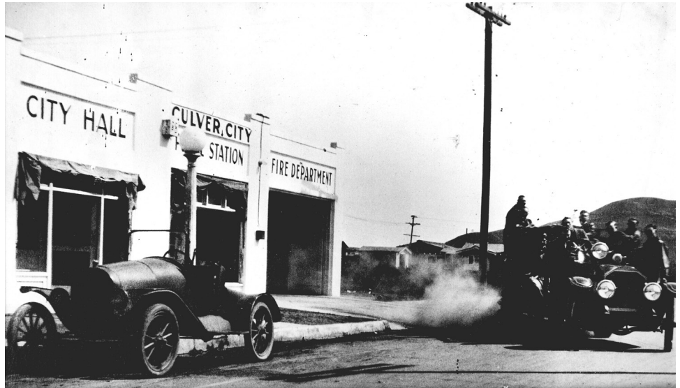
The first city hall, and police and fire department station was located on Van Buren Street.