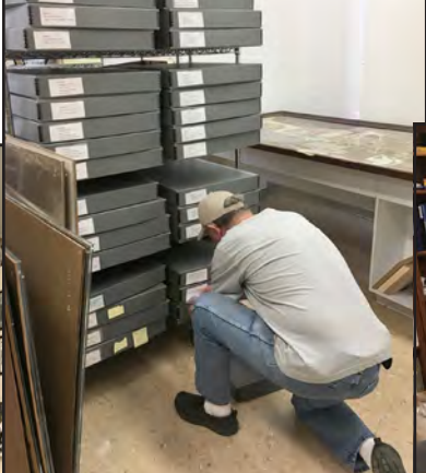
Our collection of newspapers are nicely stacked.