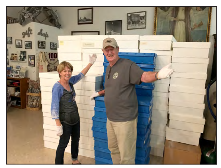
We are entrusted with storing and caring for over 70 costumes!