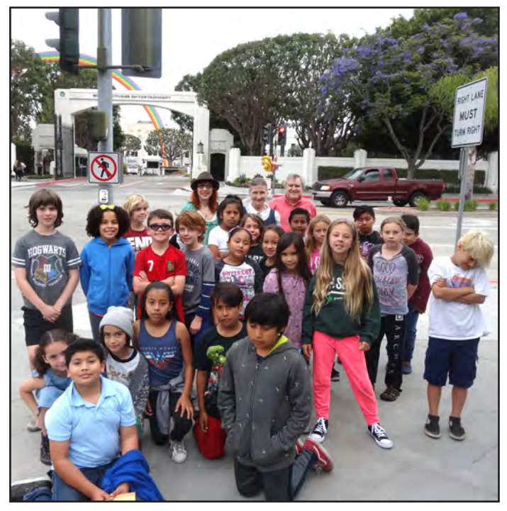
Third grade students from La Ballona on a 2018 walking tour. They asked to pose for a photo in front of the Rainbow sculpture at Sony Pictures, part of the Public Art program in Culver City!

From youngsters to adults, history can be painless education!