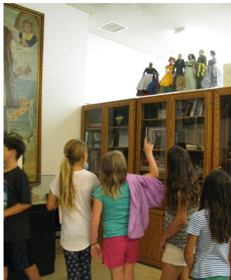
Above: Six groups of third-graders from the El Marino Language School visited the ARC to learn about Culver City history.