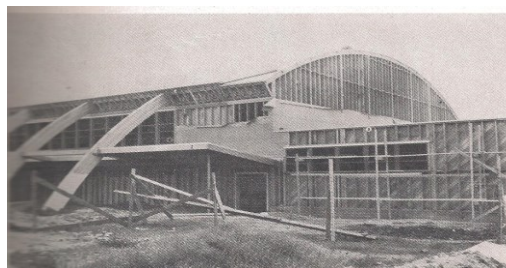
Early construction of the Culver City High School.

The public is invited to enjoy the free program and students are encouraged to attend. The CCHS Archives & Resource Center (ARC) will be briefly opened following the meeting. For more information, please call the Society at (310) 253-6941 or email us at info@CulverCityHistoricalSociety.org . Also, visit our website: www.CulverCityHistoricalSociety.org for updates.