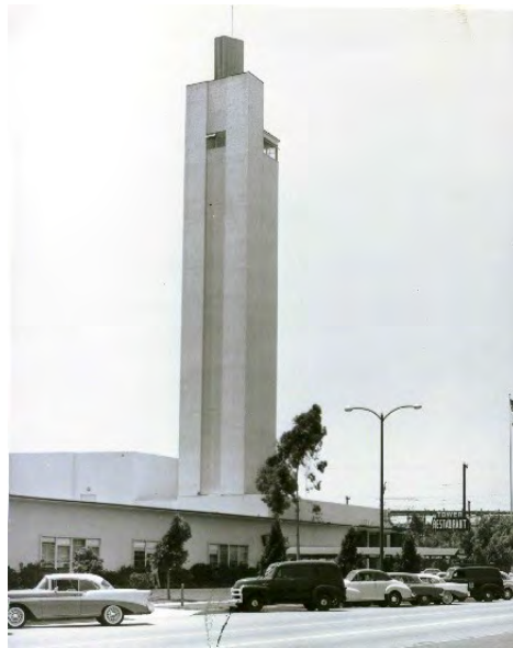
Above: The CC Historical Society marked the Veterans Memorial Building (built 1950) as Historic Site #13. The plaque is visible on Overland Ave. near Culver Blvd.

And now, because these commitments have not been honored, our community has sadly become combative in order to draw attention to properties like the Culver Ice Arena, just to get the city to revisit historic preservation. We need to do better. Please support your Society's positive efforts to encourage historic preservation as required by the Culver City Municipal Code.