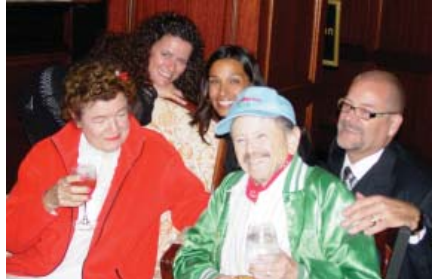
The Last "Munchkin" Jerry Maren

Gone With The Wind was filmed at Selznick Studios (now The Culver Studios). Tara was built on the "40 Acres" studio backlot, where the "burning of Atlanta" was filmed, as well.