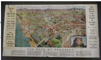
"Map of Progress"