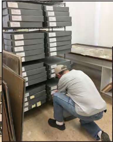
Our collection of newspapers are nicely stacked.