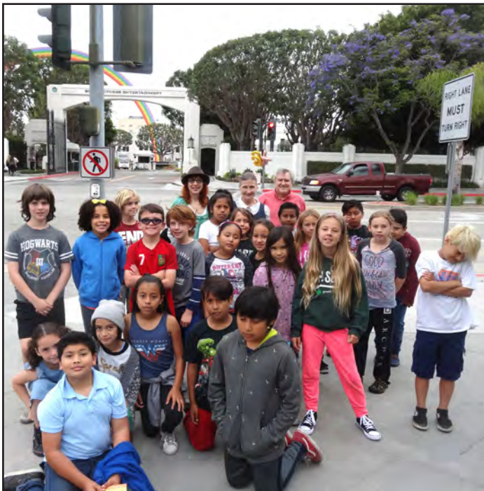
Third grade students from La Ballona on a 2018 walking tour. They asked to pose for a photo in front of the Rainbow sculpture at Sony Pictures, part of the Public Art program in Culver City!

From youngsters to adults, history can be painless education!