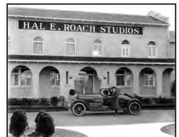
Hal E. Roach Studios, 1921