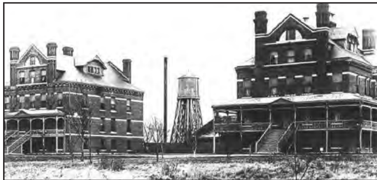
Industrial School for Girls, c.1912

Stayed tuned for the finale in our winter newsletter!