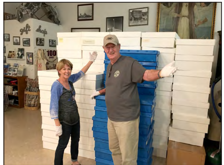
We are entrusted with storing and caring for over 70 costumes!